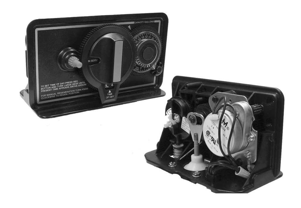
5600 L-Style Time Clock