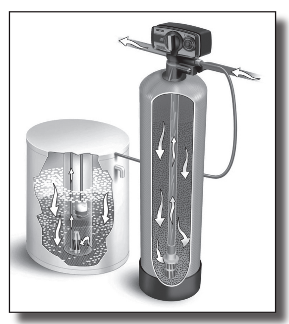
Illustration of Water Flowing Through a System

Slow rinse of the resin bed. Water flows down through the resin bed up the bottom distributor and out the drain.